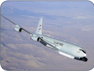
Joint Surveillance Target Attack Radar System (JSTARS) is affiliated with Hanscom Air Force Base.