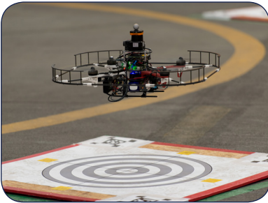
UAV testing in the 102nd Intelligence Wing's hangar at JBCC.