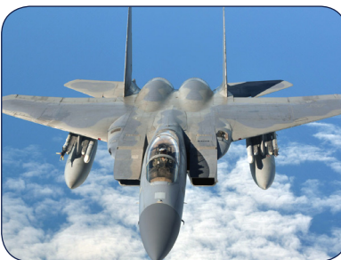
F-15 aircraft fly out of Barnes.

HANSCOM AIR FORCE BASE occupies 846 acres within Bedford, Concord, Lexington, and Lincoln and is adjacent to L.G. Hanscom Field, a full-service general aviation airport owned and operated by Massport. Hanscom Air Force Base is home to Program Executive Offices of the Air Force Life Cycle Management Center and the Air Force Nuclear Weapons Center and is controlled by the 66th Air Base Group. This multi-agency base includes the Massachusetts National Guard Joint Force Headquarters, the Massachusetts Institute of Technology's Lincoln Labs, the Hanscom Collaboration and Innovation Center, and will soon house the U.S. Army Corps of Engineers.