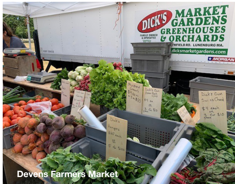
Devens Farmers Market

Visitors are encouraged to explore the natural surroundings in Devens as well as its history. The Fort Devens Museum offers a free guide to the many monuments that exist throughout the community that pay tribute to our Veterans.