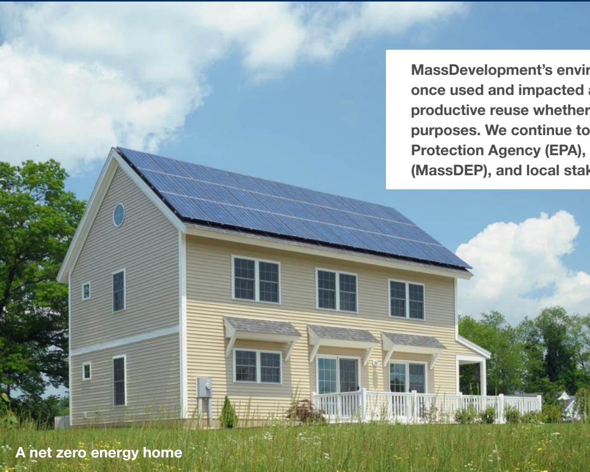
A net zero energy home

Devens is a model for sustainable redevelopment of a former military base and continues to build on its 4-star STAR Sustainable Community Rating, LEED for Cities and Communities certification, and status as a premier eco-industrial park.