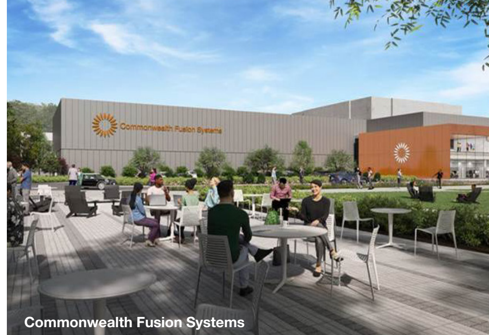
Commonwealth Fusion Systems

Drug maker Bristol Myers Squibb is expanding their bio-manufacturing campus with a 244,000-square-foot, state-of-the-art Cell Therapy manufacturing facility. The company has highly trained manufacturing teams that work in one of the most technologically advanced environments in the world. This new addition includes specialized processing suites, quality assurance and quality control facilities, packaging, office, and storage space for the development of a new form of cancer treatment.