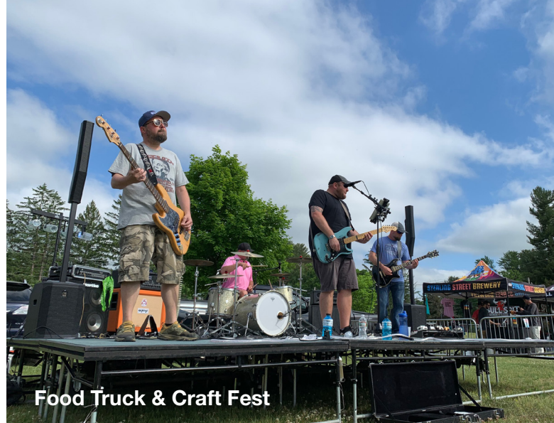
Food Truck & Craft Fest

Public Safety is comprised of the Devens Fire Department, Emergency Management, and the Massachusetts State Police . In FY 2022, the Devens Fire Department improved their efforts to recruit a more diverse workforce, adding women, minority, and bilingual staff members. Over the course of the year, the fire prevention team completed more than 300 inspections directly contributing to an increase in workplace fire safety across the community.