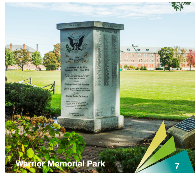
Warrior Memorial Park