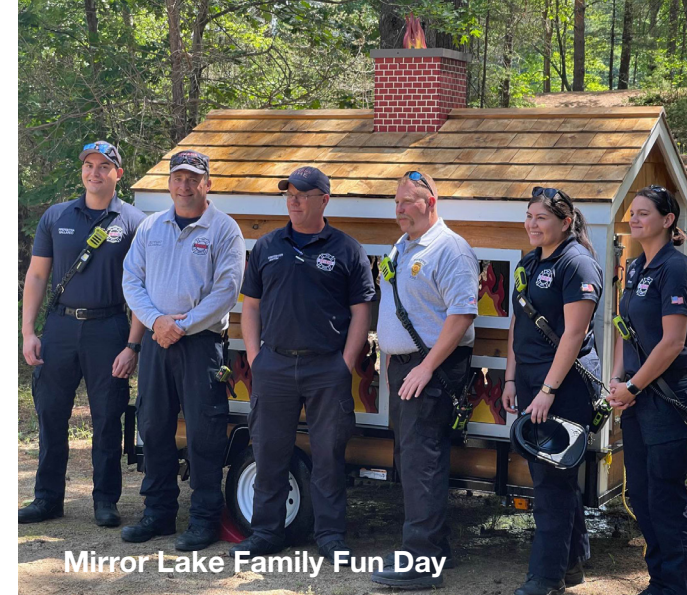
Mirror Lake Family Fun Day

MassDevelopment contracts with the Massachusetts State Police for customary policing of criminal activities, traffic enforcement, investigation of motor vehicle crashes, and responses to emergency 911 calls.