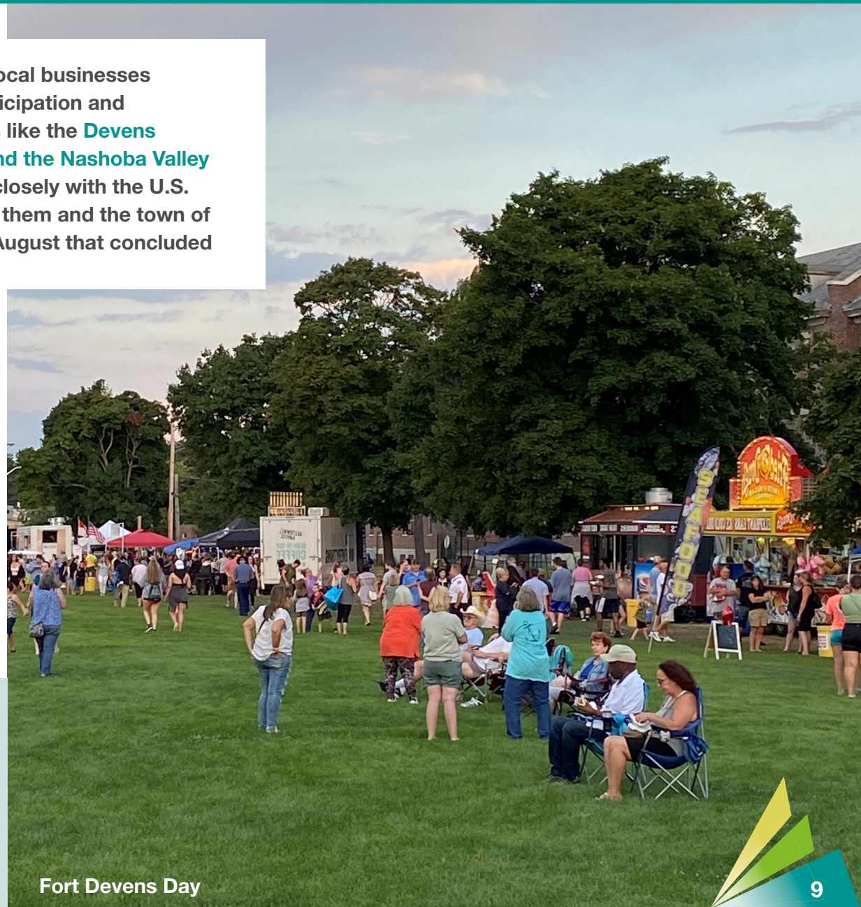
Fort Devens Day

By choosing Devens, residents are embracing a mixed-use community that incorporates open space and outdoor recreation with professional management and smart business growth.