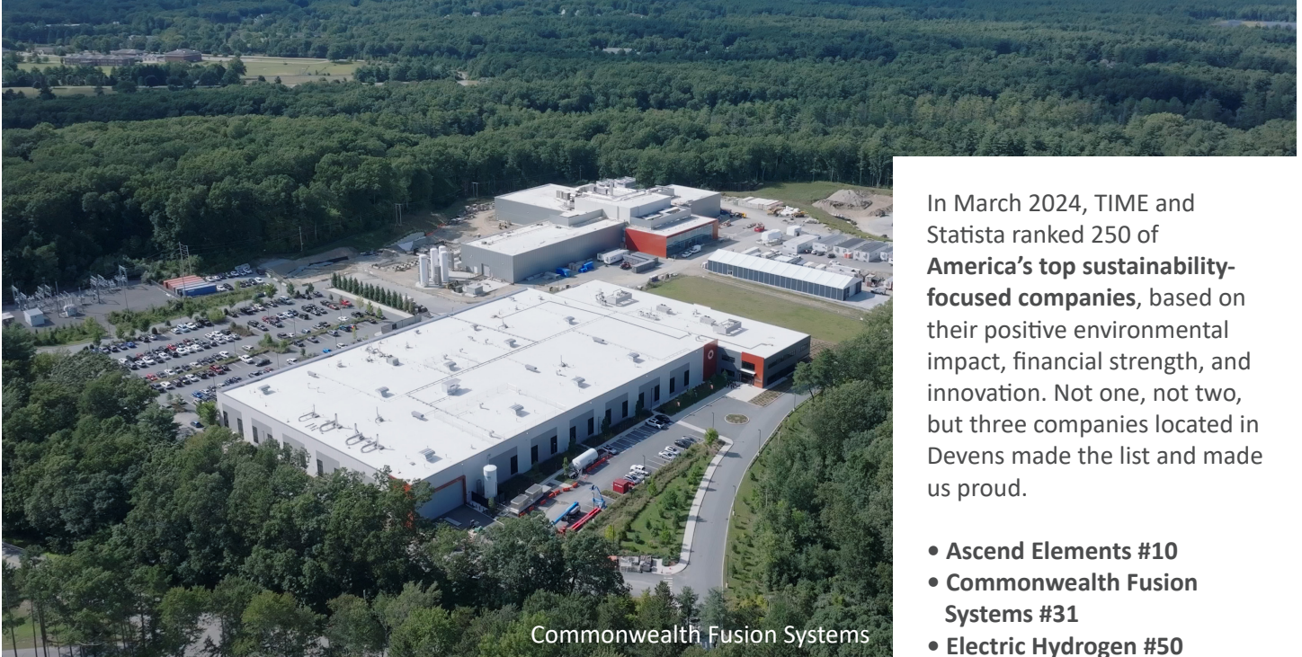
Commonwealth Fusion Systems

In March 2024, TIME and Statista ranked 250 of America's top sustainability-focused companies , based on their positive environmental impact, financial strength, and innovation. Not one, not two, but three companies located in Devens made the list and made us proud.