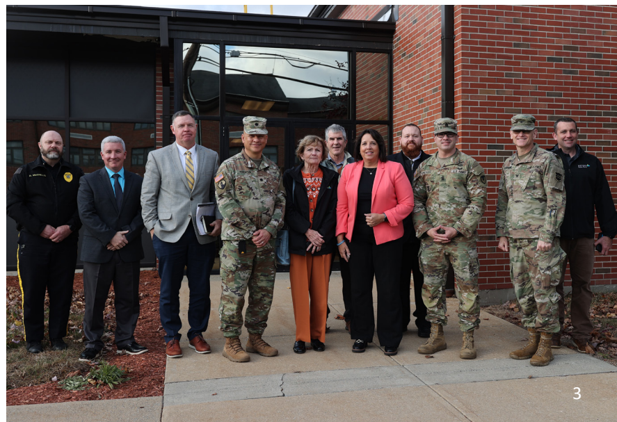
Photos: Devens Aerial 1960s and WAC Detachment 1973 photos courtesy of the Fort Devens Museum. Lieutenant Governor Kim Driscoll visits the Devens RFTA.